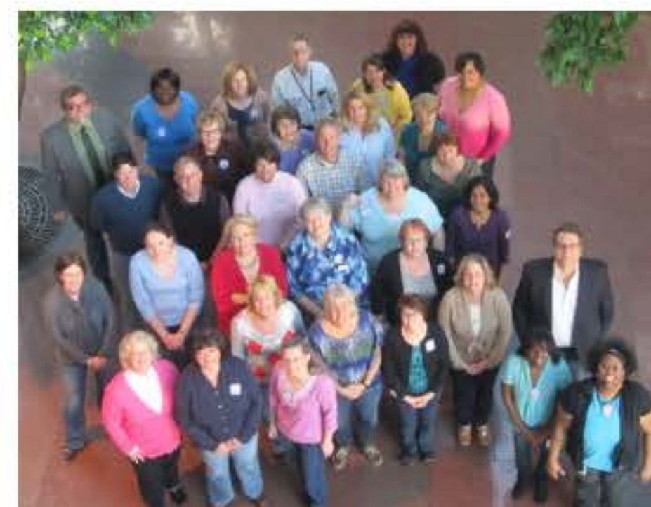
Thanks to employees at Quarles & Brady, LLC for hosting and participating in fundraisers that support Aurora Health Care Foundation.

When you're ready, complete the Community Event Proposal Form in the downloadable tool kit below, and return it to one of our community fundraising contacts listed in the booklet. The tool includes ideas, tips and contact information to help you get started!