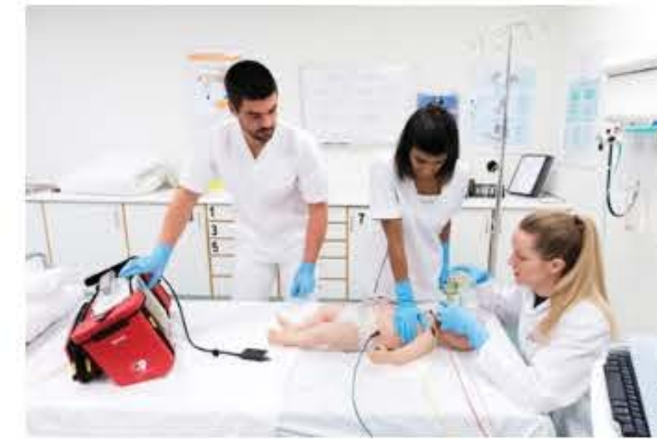
You helped purchase key simulation technologies for our community. Thank you! See photos from last year's event here

Help expand much-needed behavioral health services in our community.